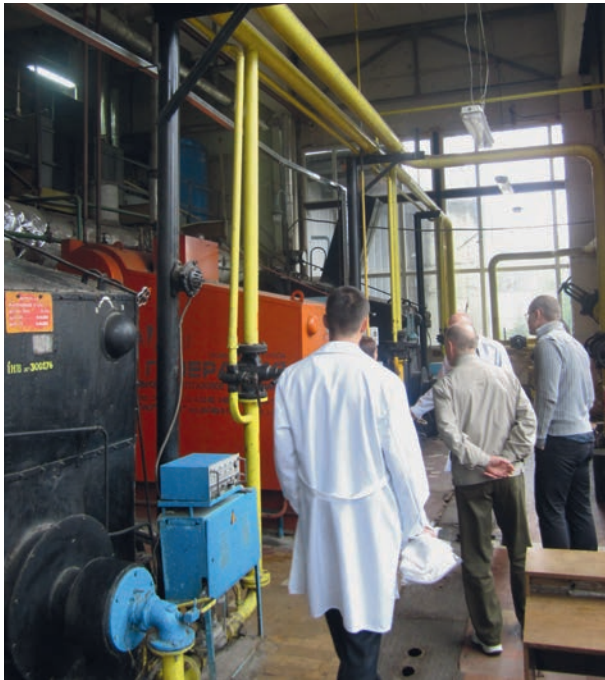
Installation of heat exchangers at one of the leading industrial bakeries in Ukraine.

processing factory and a biogas system in a pig farm are in preparation. The project has also supported the Government of Ukraine in the development of a national renewable energy action plan and is preparing extensive training for managers and technicians in the agro-food sector to begin later in 2014. UNIDO is also designing a postgraduate master's course on energy efficiency and renewable energy in the agro-food sector.