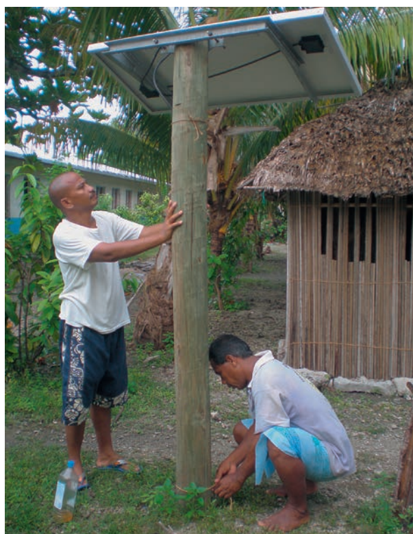
Installation of photovoltaic units in the Pacific Island region.

As part of its global network of regional sustainable energy centres, which are supported by the Governments of Austria and Spain, UNIDO was requested by the Sustainable Energy Island Initiative of the Alliance of Small Island States to assist island nations in the Caribbean and Pacific in the creation of renewable energy and energy efficiency centres. Discussions have taken place with stakeholders and a final agreement on the centres is expected in 2014. In a parallel initiative, UNIDO has launched a new programme with financial support from the Government of Austria that will encourage investment in renewable energy technologies. Progress to date includes preparations for renewable energy and energy efficiency demonstration plants in selected Pacific Island States, including Kiribati (tuna processing), Papua New Guinea (tuna processing),