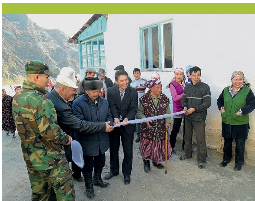
Ribbon-cutting ceremony at Razan-Sai, Kyrgyzstan.

October saw the convening of the biennial International Conference on Oil Palm and the Environment in Selangor, Malaysia. Organized jointly by UNIDO and the Malaysian Palm Oil Board, the conference looked at the challenges of balancing the economic, social and environmental development of the oil palm business. It provided an opportunity for UNIDO to present a new research study, Global Assessments and Guidelines for Sustainable Liquid Biofuel Production in Developing Countries , and the Biofuels Screening Toolkit. The research study, carried out by UNIDO in collaboration with UNEP, the Food and Agriculture Organization of the United Nations and funded by GEF, aimed to establish clear guidelines to help developing countries mitigate the negative environmental and socioeconomic impacts of future biofuel projects and to develop a tool to assist GEF with project funding decisions. Case studies were completed in Argentina, Mozambique and Ukraine on the impacts of the scale-up of biofuel production. The findings and recommendations of the research project were discussed at a conference, organized by UNIDO in March in Vienna. The Biofuels Screening Toolkit, a major outcome of the