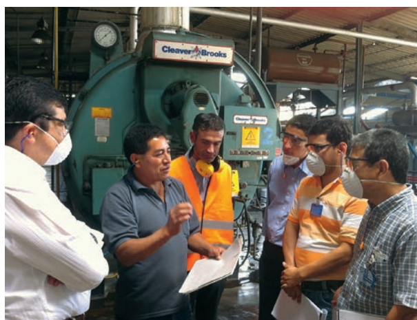
A boiler operator in Ecuador explains to trainees the changes in operational practices that resulted in a 25 per cent energy saving.

Under the UNIDO energy management system and system optimization programme, projects were launched in Egypt and the Islamic Republic of Iran bringing to 11 the total number of ongoing projects in this field. By the end of the year, the programme involved over 5,000 decision makers; UNIDO had provided in-depth training on implementation and system optimization to more than 700 energy efficiency consultants, trained some 4,500 employees and assisted over 100 companies in the implementation of energy management systems in line with ISO 50001 and state-of-the-art system optimization practices and know-how. Some of the companies involved have already taken steps to gain third-party certification to ISO 50001. In South Africa, 31 graduates completed a UNIDO-accredited training and certification programme for ISO 50001 in July and are now qualified to lead an audit team to certify a company as ISO 50001-compliant. The certification programme was a component of a larger project to improve energy efficiency in South Africa and represented the entry step for UNIDO's work on ISO 50001 conformity