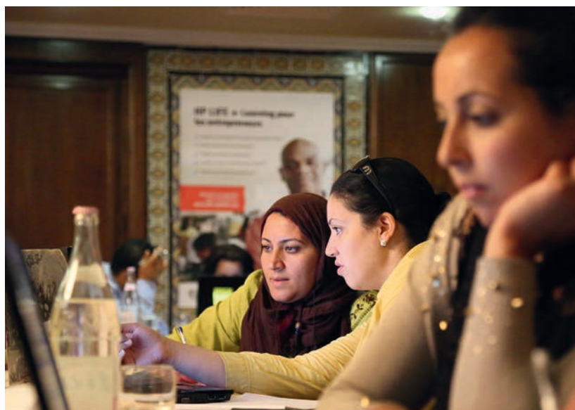
Group work at the HP LIFE e-learning training of trainers in Kairouan, Tunisia.

The empowerment of young entrepreneurs and the creation of employment opportunities for women are a priority for UNIDO's Investment Promotion Programme for Iraq. Enterprise Development Centres located in Baghdad, Thi Qar, Basra and Erbil are providing young people with the skills to start their own businesses or find suitable employment in existing enterprises. A new UNIDO initiative in Tunisia is hoping to create at least 1,600 jobs for youth in the vulnerable regions of El Kef, Kairouan, Kasserine and Sidi Bouzid through entrepreneurship and enterprise development. This $2.9 million project, financed by the Government of Italy, the United States Agency for International Development and Hewlett-Packard (HP), will enhance the capacities of regional and local business support institutions, training centres, universities and vocational training institutes relating to enterprise creation and development. Over 1,000 aspiring entrepreneurs will attend enterprise promotion seminars and 800 young entrepreneurs will undergo enterprise creation training. In addition, 8,400 young entrepreneurs will receive the information technology tools needed to increase their business efficiency and growth through HP's Learning Initiative for Entrepreneurs (HP LIFE) training, either face-to-face or through the HP LIFE online training platform. A further 146 HP LIFE entrepreneurs as well as 40 start-up entrepreneurs will receive direct