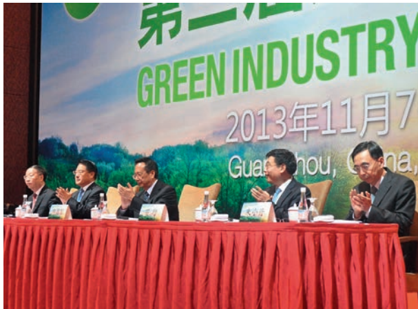
The 2013 Green Industry Conference in Guangzhou, China.

In cooperation with the Ministry of Industry and Information Technology of China, UNIDO organized the 2013 Green Industry Conference in Guangzhou, China in November, that focused on creating a circular economy through resource efficiency and effective environmental management and policy. The conference looked at ways to apply green industry concepts to manufacturing processes and provided a platform for some 700 participants to exchange experiences and learn about new initiatives and projects relevant to the implementation of green industry measures at the country level. During his visit to China, Director General LI Yong signed a memorandum of understanding with the Minister of Industry and Information Technology to promote green industry and cleaner production in China, including industrial water and energy efficiency and programmes to reduce the use of lead.