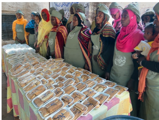
Employment opportunities for young people in Kassala, Sudan.

Youth employment is one of the most pressing challenges in many countries, especially developing countries. The creation of employment opportunities requires concerted efforts by governments, the international community, the private sector, young people themselves and other stakeholders. UNIDO has been mandated to pursue the development of projects and programmes to reduce poverty among young people through the acquisition of skills and capacity enhancement activities and financial support to creative industries and micro, small- and medium-scale enterprises.