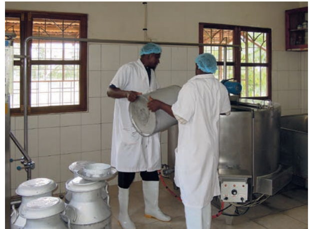
Milk-processing plant in the United Republic of Tanzania.

As part of the African Agribusiness and Agro-industries Development Initiative (3ADI) adopted three years ago in Nigeria, UNIDO has been working with the Food and Agriculture Organization of the United Nations (FAO) in supporting the East African Community in its agri-enterprises and agro-industries development programme covering Burundi, Kenya, Rwanda, Uganda and the United Republic of Tanzania. FAO and UNIDO have jointly supported value-chain development activities in Burkina Faso, Comoros, the Democratic Republic of the Congo, Ghana, Liberia, Madagascar, Nigeria, Rwanda, Sierra Leone, Sudan and the United Republic of Tanzania, where a five-day workshop on agribusiness investment promotion took place in October. The UNIDO-FAO workshop was planned in the context of the 3ADI and Africa Investment Promotion Agency Network