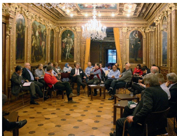
The executive training programme at Hernstein Castle.

The readiness of countries to self-fund technical cooperation projects in the field of industrial statistics is testimony to their confidence in UNIDO's statistical expertise. Funding was approved during the year for new projects in Gabon and Oman, as well as a regional project for member countries of the Commonwealth of Independent States, where representatives of national statistics offices from the region took part in a two-day high-level inception seminar in December.