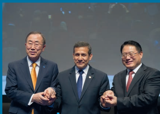
The President of Peru [centre] with the United Nations Secretary-General (l.) and the Director General of UNIDO (r.).

Women's leadership on energy justice in productive sectors was the theme of a side event at the Vienna Energy Conference in May that highlighted key issues in the gender-energy-development paradigm and explored best practices and lessons learned to address those issues. A guidance note prepared by UNIDO in cooperation with the United Nations Entity for Gender Equality and the Empowerment of Women (UN Women) and entitled Sustainable Energy for All: the Gender Dimensions aims to guide policymakers and key stakeholders in developing programmatic and policy activities that enhance the role of women in developing and implementing clean and sustainable energy solutions. Again in cooperation with UN Women, UNIDO sponsored the 2013 SEED Gender Equality Award to support the most promising