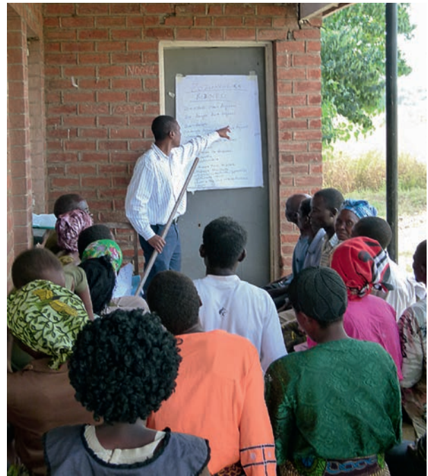
Teaching entrepreneurial skills to villagers in Salima, Malawi.

While a staggering 75 per cent of the world's poor live in rural areas, policies and resources continue to be biased in favour of urban development. Harnessing the productivity and entrepreneurial potential of rural communities is indispensable in the effort to achieve resilient economic growth and raise people above the poverty line. This is the challenge set out in a brochure, Promoting Livelihood Security by Adding Value to