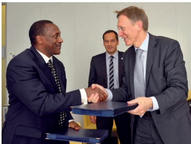
Kandeh K. Yumkella, former Director General of UNIDO (l.) and Janez Potočnik, Commissioner for the Environment (r.) sign an EU-UNIDO joint statement on environment and resource efficiency in Brussels in April.

The year under review witnessed a deepening and broadening of the partnership between UNIDO and European Union (EU) institutions. The value of funding agreements signed in 2013 between UNIDO and EU institutions contributed to the record level of funds mobilized (including future payments due under signed agreements) in the reporting period. High-level policy dialogues ensured that UNIDO's role and competencies in agribusiness, SME development, sustainable energy, youth employment, green industry and resource efficiency were reflected in a range of documents and joint statements.