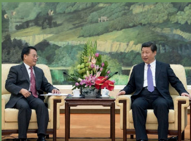
The President of China (r.) and the Director General of UNIDO (l.).