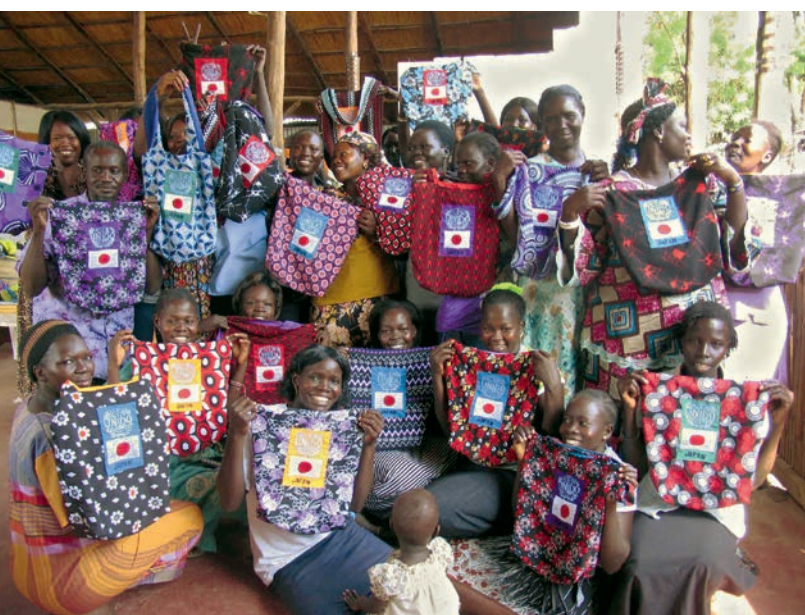
South Sudanese youth acquire the know-how and experience to enable them to achieve sustainable livelihoods either through self-employment or by working in the private sector.

the selected value chains—coffee and fruits and vegetables—to ensure that a minimum number of women participated in training and in the training of trainers modules in particular. The Burundi project will promulgate voluntary standards, including the International Labour Organization principle of equal pay for equal work and compliance with national regulations protecting pregnant women and new mothers.