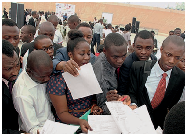
The Abuja Entrepreneurship and Career Fair was organized by UNIDO in cooperation with the Nigerian Federal Ministry of Industry, Trade and Investment.

Over the past seven years, UNIDO's commitment to ensuring that young people in Mozambique have the skills necessary to start their own businesses has yielded outstanding results. Under a youth project financed by the Government of Norway, entrepreneurship was added to the curriculum of 331 schools for grades 9 to 12. By the time the project was completed at the end of the year, 1,654 teachers had been trained and nearly 500,000 students were enrolled in the course. The Ministry of Education and Culture has integrated the programme into the national education strategy, ensuring that UNIDO's legacy will make a lasting difference to the lives of young people in Mozambique.