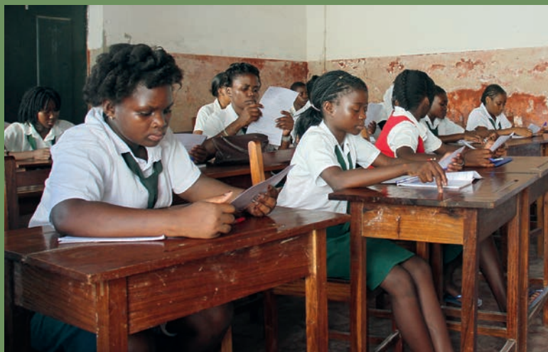
Helping build young entrepreneurs in Mozambique.

At the operational level, UNIDO was involved in country-level joint programming, including the formulation of United Nations