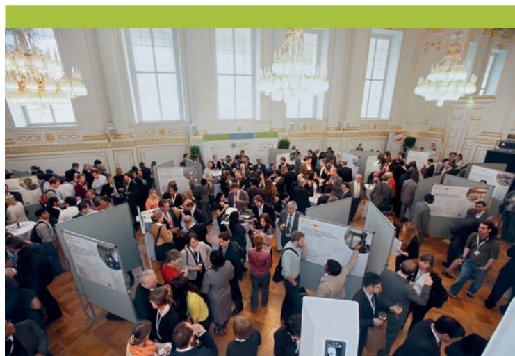
The Third Vienna Energy Forum exhibition.

August saw the launch of a joint initiative between UNIDO and the Ministry of Economy, Trade and