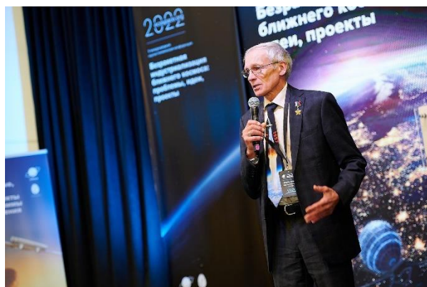
Pilot-Cosmonaut, Hero of the Russian Federation Sergey Avdeev

“The tasks of industrial space exploration and the implementation of projects within the framework of the international platform EcoWorld can become an important part of the concept of sustainable development with practically applicable results” he said.