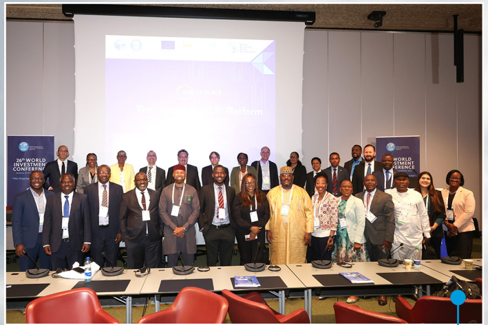
Invest-in-ACP Portal is launched at WAIPA WIC 2022