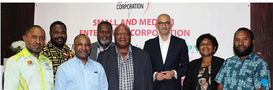
SME Corporation Papua New Guinea becomes part of the Programme

At the micro level, South-South linkages are fostered between ACP producer associations, businesses and member states.