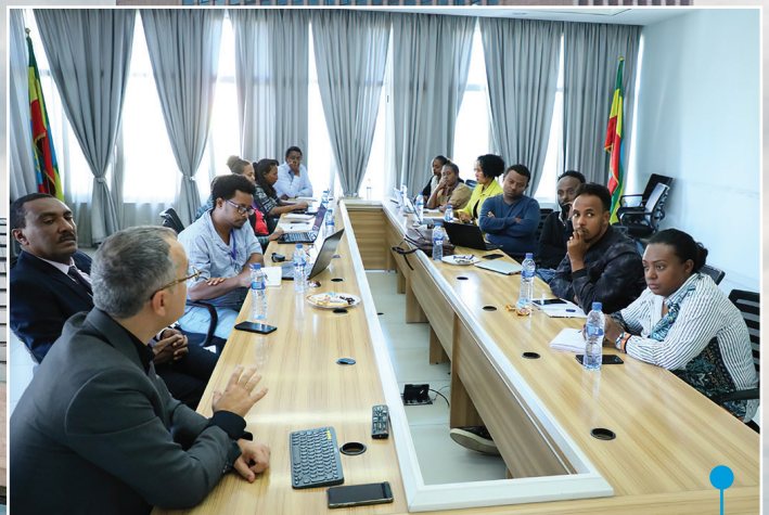
Capacity building on FDI investment monitoring and support services to the Ethiopia Investment Commission